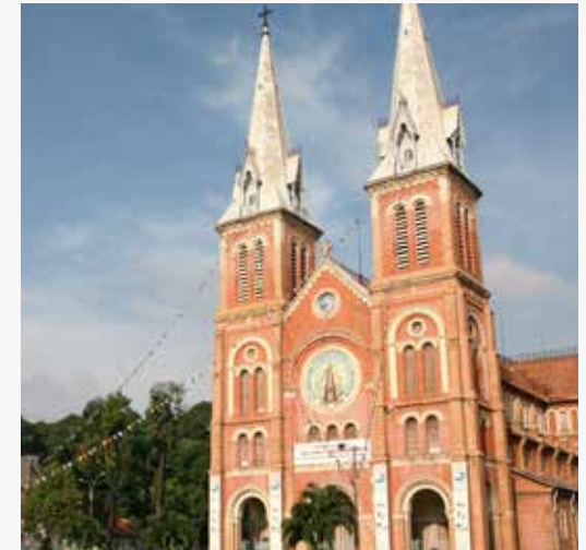
Saigon Notre-Dame Basilica

Additionally, having an optional evaluation component, the program can be taken to fulfill a three-credit course. If students want to transfer their credits back to their home institutions, they are required to fulfil the program's evaluation scheme.